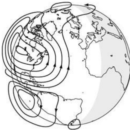
Figure 1. Fluctuating EMF patterns over North America: Schematic diagram of the EMF current pattern above the Earth's surface, driven by daytime atmospheric winds cause by heating from the sun (USGS).

Magnetic fields emanate from the Earth itself, generated by electric currents within the planet's core and high above its surface. These forces facilitated the development of modern navigation systems, and are studied today to better understand the geomagnetic activity of the Earth. Geomagnetic Observatories operated by the US Geological Survey – such as the station in Newport, Oregon – monitor and collect data pertaining to naturally-occurring fluctuations in magnetic fields in North America (USGS; see Figure 1).