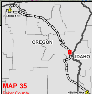
MAP 35 Baker County